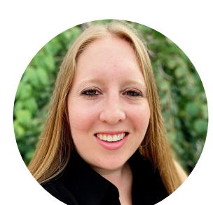
Maribel Street, CEM