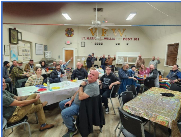
The Region 8 Social was at the VFW Post 101 in Colorado Springs (where the drinks were a lot less than anyplace else!). Approximately 35 attended. Also, the pizza was good. And the people were wonderful! Thank you, Becky!!