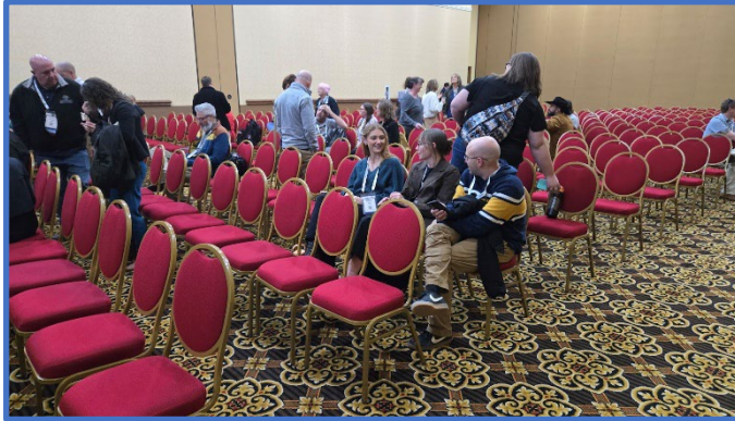
Preparing for the Region 8 Annual Meeting. There were 97 people in attendance. (Copies of the minutes and sign-in sheets and presentation sent along with this newsletter.)